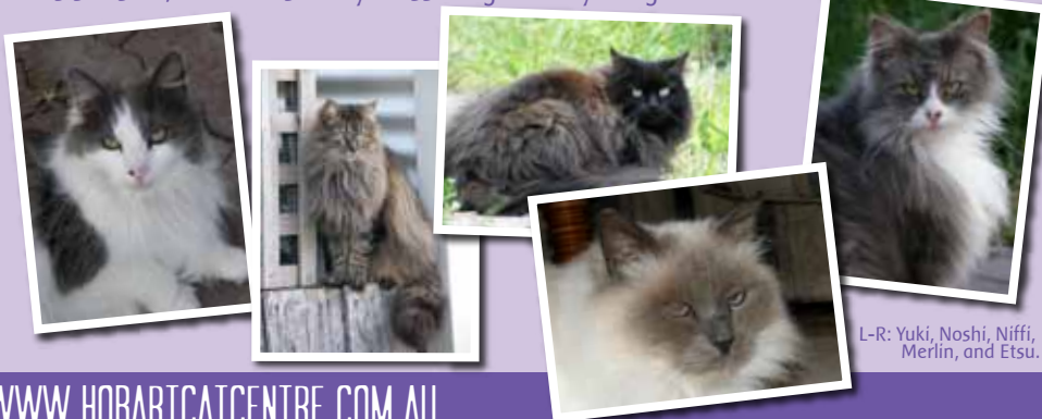
L-R: Yuki, Noshi, Niffi, Merlin, and Etsu.

My Mummy even did me at my old age because at the time I was very ugly looking apparently and the vet thought that if I got lost people wouldn't think I was owned, so I would not be returned to my lovely new home. So no matter how lost I get or if someone does steal me I now have the best chance of coming home to my Mummy and brothers and sisters. That to me is really reassuring. Don't you agree?